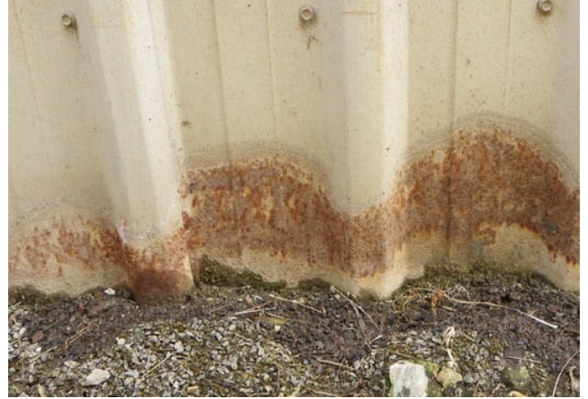
Figure 3. Corrosion due to immersion in soil

Similarly, storage of items alongside, and/or against the shed wall, that prevent washdown and/or drying cycles, should also be avoided.