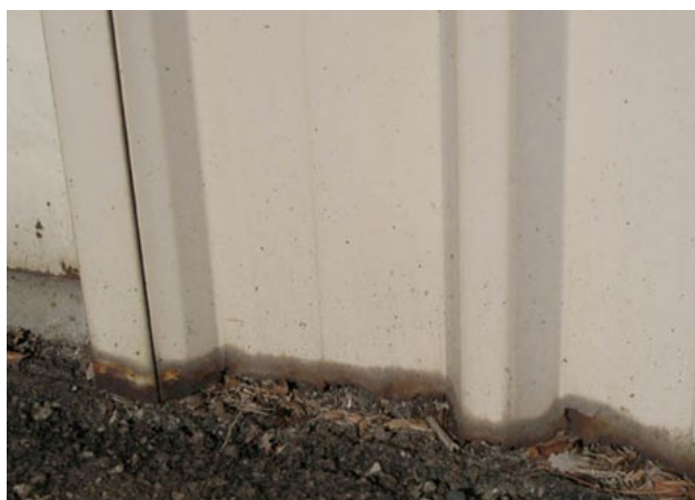
Figure 2. Corrosion due to inappropriate wall design

The consequence of not maintaining a free drip edge may be premature corrosion. This is due to the retention of moisture at the cut edge of the steel when in contact with other materials. Bricks, pavers, concrete slabs and even other metallic products may contribute to this mechanism when installed incorrectly. Please refer to Figure 2 for an example.